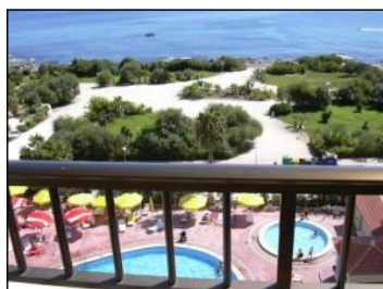
Cabo Cervera Hotel: beachside venue for Costa Blanca English-speaking AA Convention

Surely sobriety and serenity shall follow me all the days of my life, twenty-four hours at a time, as I surrender my will to Thine and carry the message to others; and I shall dwell in the house of my Higher Power daily. Forever and Ever.