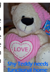
Shy Teddy needs functional home

This will take place during an interval in the music. Prizes will be on display in Torrevieja C from around 9:30pm.